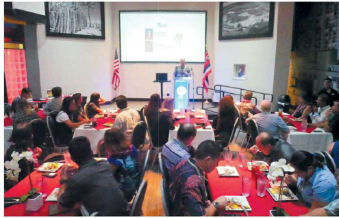
Kaka'ako Improvement Association holds membership meetings and networking events for those who want to keep Kaka'ako a community-minded neighborhood.

The HCDA website states, "Upon the HCDA's creation, the Legislature designated the Kaka'ako area of Honolulu as the Authority's first Community Development District. Lawmakers recognized Kaka'ako was severely underdeveloped and underutilized, relative to its central location near urban Honolulu. They foresaw the area's potential and opened the door to tremendous opportunities in providing more housing, parks, open areas, as well as